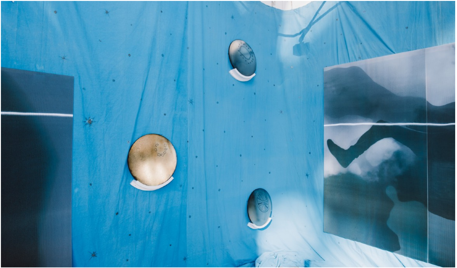
Madragoa's booth at Art Basel Paris 2024